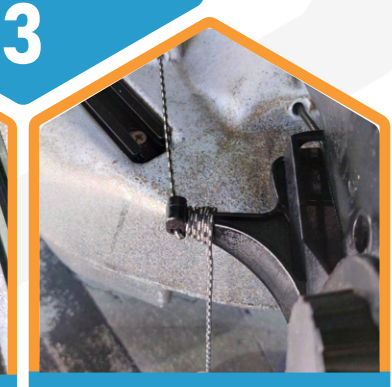
Wrap the remaining cord around the rudder assembly and tie it off.