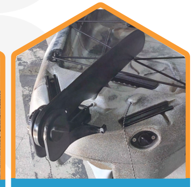
Set the rudder into the groove to ensure it is sitting in the center.