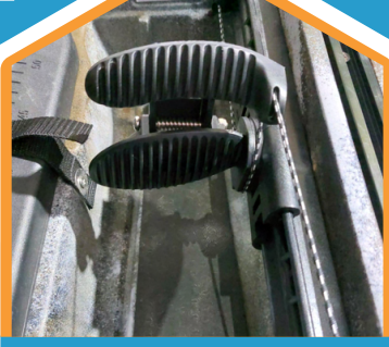
Pull the cord until the top of the foot pedal is in line with the bottom of the pedal.