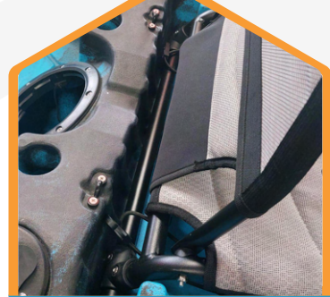
Using the bungee cord underneath the seat strap, loop the bungee cord over the clip.