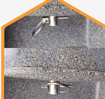
Secure the rudder onto the back with the included steel pin.

Insert the rudder into the steel ring at the back of the kayak.