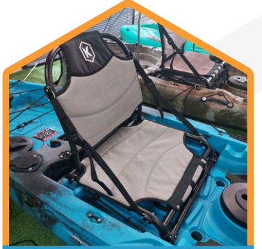
Place the seat in the allocated grooves.