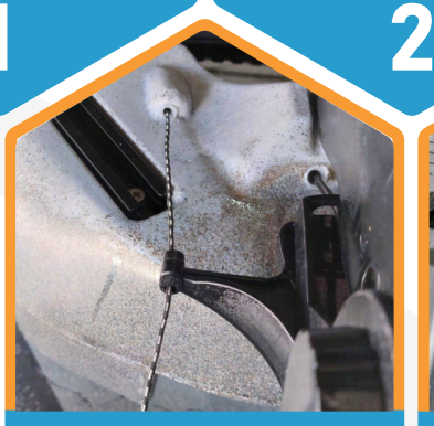
Feed the cord through the hole on either side of the rudder assembly.