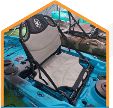
Place the seat in the allocated grooves.