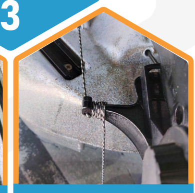
Wrap the remaining cord around the rudder assembly and tie it off.