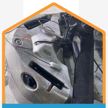
Insert the rudder into the stee ring at the back of the kayak.