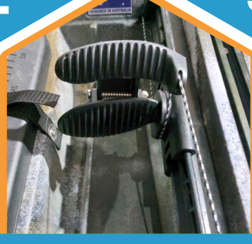
Pull the cord until the top of the foot pedal is in line with the bottom of the pedal.