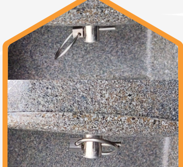
Secure the rudder onto the back with the included steel pin.