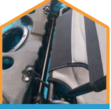
Connect to the rear eyehooks to secure the seat