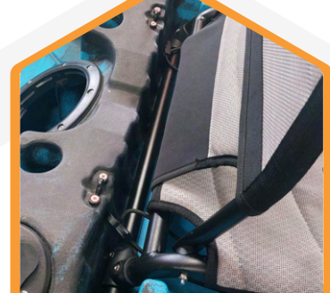
Using the bungee cord underneath the seat strap, loop the bungee cord over the clip.