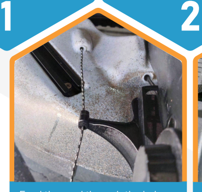
Feed the cord through the hole on either side of the rudder assembly.