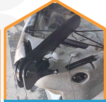
Set the rudder into the groove to ensure it is sitting in the center.