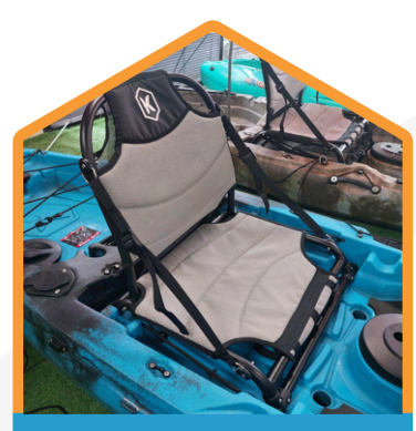
Place the seat in the allocated grooves.