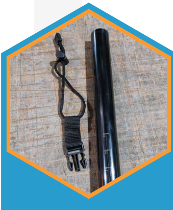
Disconnect the paddle end of the paddle leash.