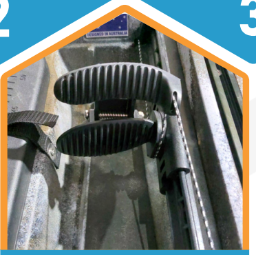
Pull the cord until the top of the foot pedal is in line with