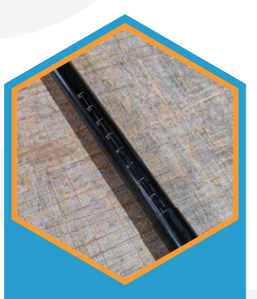
Disconnect the paddle into two pieces.

Place the disconnected paddle into the paddle leash.