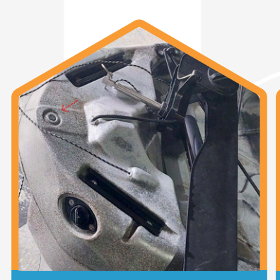
Insert the rudder into the steel ring at the back of the kayak.