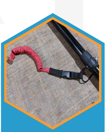
Reconnect the paddle leash and paddle.