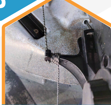
Wrap the remaining cord around the rudder assembly and tie it off.