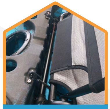
Connect to the rear eyehooks to secure the seat