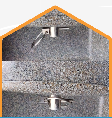
Secure the rudder onto the back with the included steel pin.