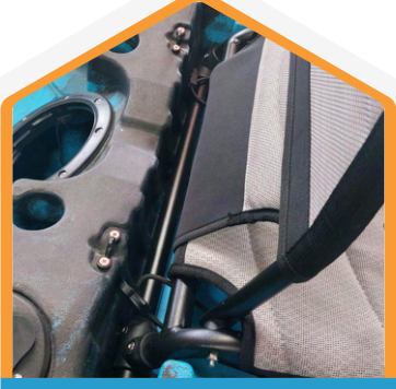
Using the bungee cord underneath the seat strap, loop the bungee cord over the clip.